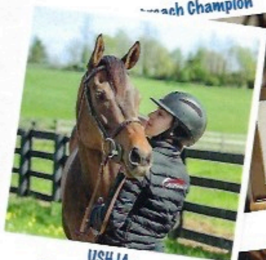
USHJA Outreach Champion