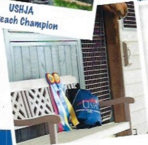
USHJA Outreach Champion