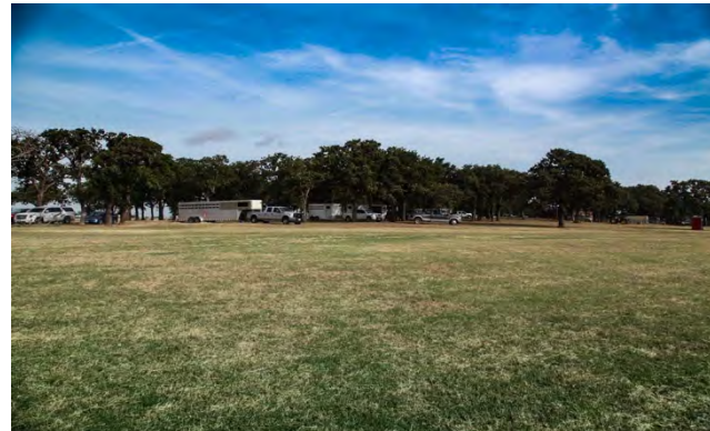
Lots of Shade Parking under the post oak trees